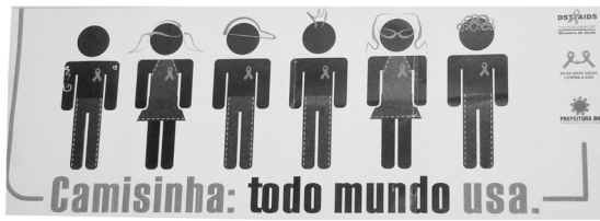
Figure 2 – Sign about sexually transmitted diseases produced by the Belo Horizonte Town Hall in partnership with the Health Ministry.

uniqueness of the subjects because of accessories such as caps, colorful hair, type of glasses (Figures 2 and 3). In this way, the sign aims to disassociate the recurring image of condoms from a specific audience.