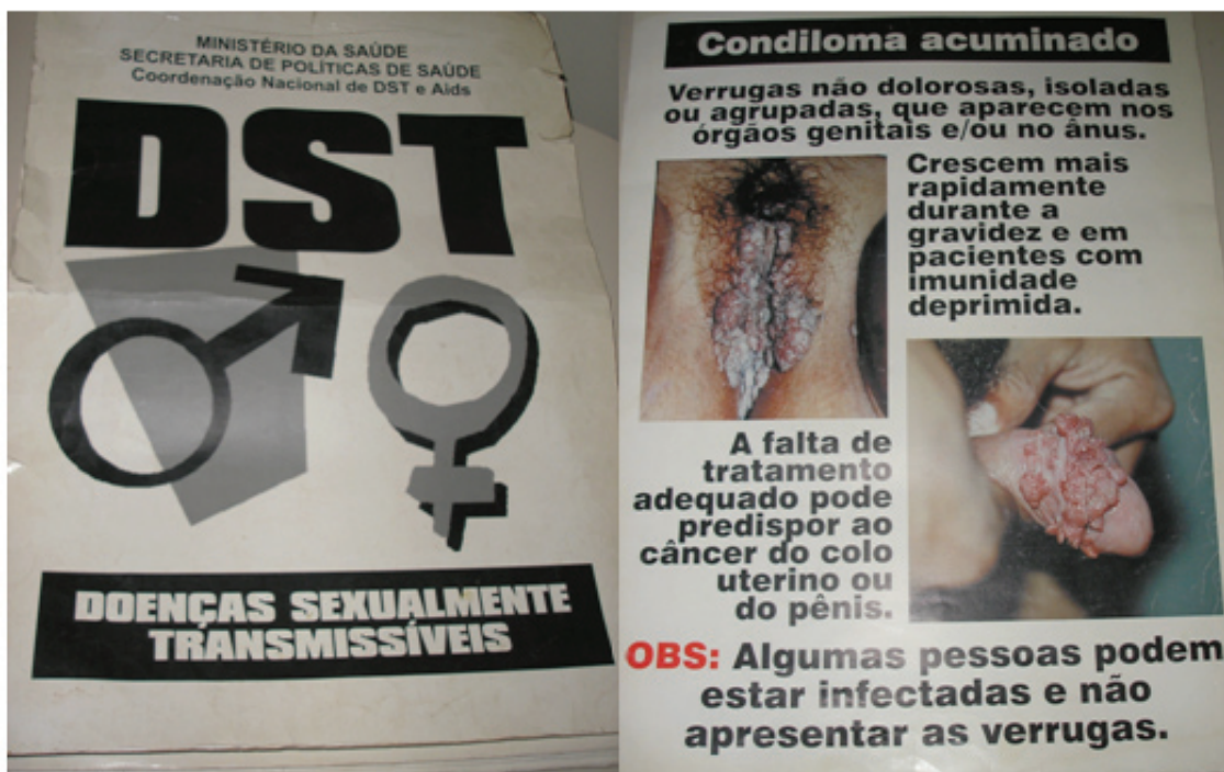
Figure 1 – Serialized album about sexually transmitted diseases used in the basic health units of Belo Horizonte.

The two signs (numbers 2 and 3, Table) carry messages that allude to condom use. In sign number 2, the text “condoms: everyone uses them” is linked to images that allude to diversity in terms of gender, ethnicity/race and also point to the