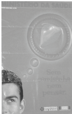
Figure 3 – Sign about sexually transmitted diseases produced by the Health Ministry.

The messages are direct, such as: “Condoms: everyone uses them” and “No condom, no way”. Out of the four leaflets, two are directed at condom use (numbers 5 and 7), with simple illustrations. They present a step by step guide for appropriate female and male condom use. The other two (numbers 4 and 6, Table 1) contain distinct approaches. Number 4 is directed at general STD information, including prevention and treatment tips and provides the address of Non-Governmental Organizations (NGO), clinics, support groups and the Center for Serum Orientation and Support (CSOS-BH), currently known as the Testing and Guidance Center (TGC-BH). It also presents tips for negotiating condom use, thus contemplating the gender relations implied in the use of contraceptive